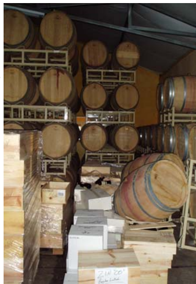
December 22, 2004 — Quakin' All Over