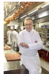
Chef Alain Ducasse