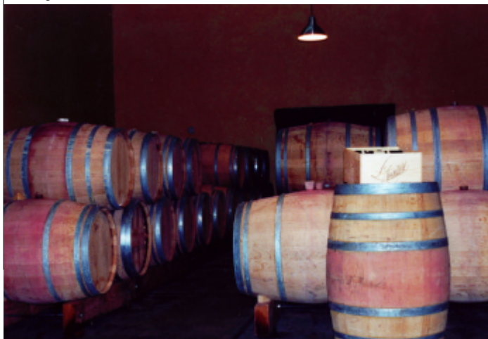
Wine resting in barrels

Open up a new, adventurous chapter for L'Aventure drinkers to explore. Specific to Stephan's big, “Paso” style, the 2002 Cab is deep and dark in color, with tremendous depth of aroma and flavor. “I swore I wouldn't do it, when I came here,” says Stephan, referring to his creation of a monovariety Cabernet, “but I couldn't help it, the fruit came in almost perfect!” Only 300 cases were produced, so look for a “members only” offering as it is released in May 2004. Syrah, the workhorse of the L'Aventure line, will be in good supply for the first time. 1.000 cases were produced, up from 300 from each of the two previous vintages. That's more good news, from a great vintage!