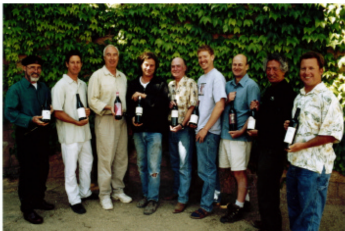
West Side Grand Crew