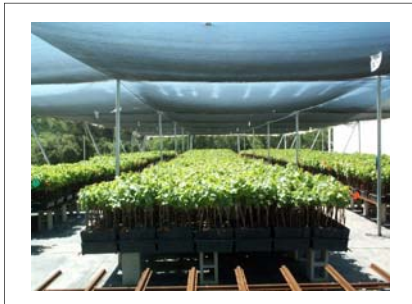
The nursery at Tablas Creek