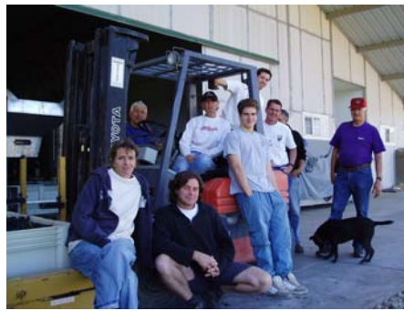
The harvest crew on the last day of the vintage, October 30, 2003

excellent harvests going back to 1999. More difficult to classify than the "big California style" wines of 1999 and 2001, and not as lean as the "classical" 2000 vintage, the 2003 will have time to grow up a bit before being judged against its peers. Let's say, 6 months?