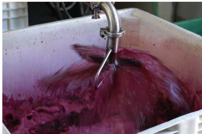
Petit Verdot undergoing macro -oxygenation

Following this primary fermentation, the wines will go into our cellar to undergo malolactic fermentation, thereby finishing the fermentation process. The Estate Syrah, for example, is currently undergoing this phase