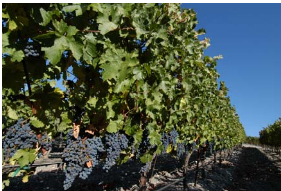
Our Vineyard, before picking

Grenache was a surprise star this year, finally living up to expectations, by delivering perfectly mature clusters, at exactly two tons per acre. In combination with the superb estate Syrah, and what looks to be a top Mourvedre crop (it's still on the vine at this writing), the 2005 Côte à Côte promises to continue its tradition of excellence. As