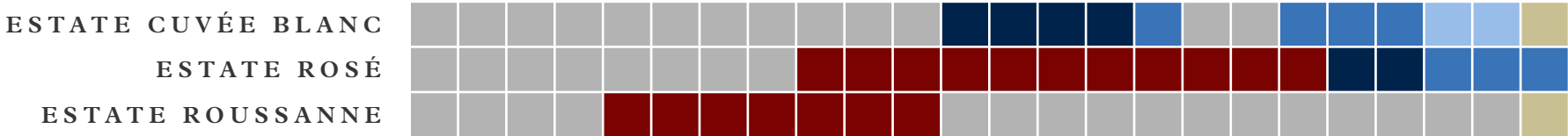
The aging chart is shown in years by vintage